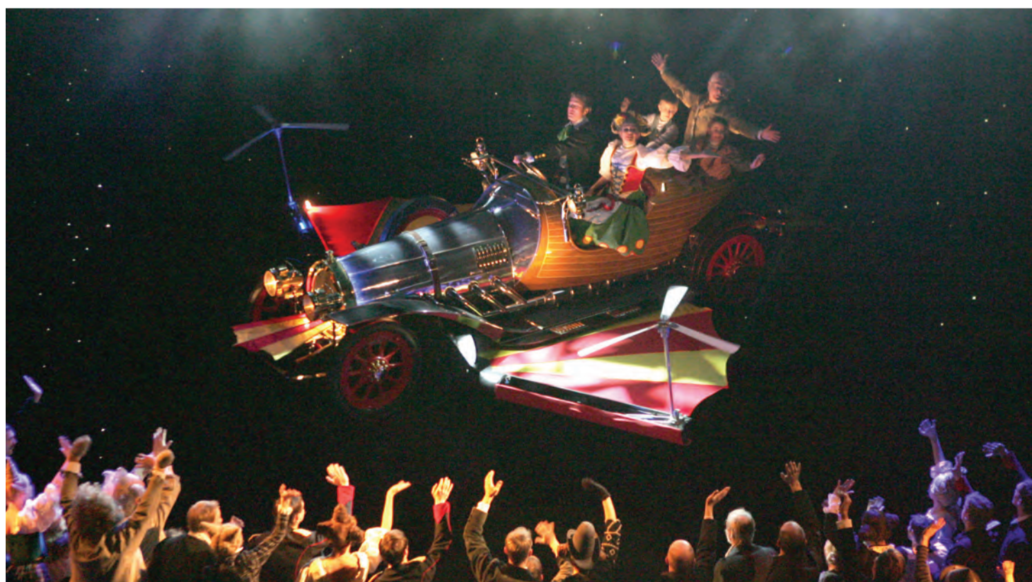
The car – an example of the automation used in Chitty Chitty Bang Bang